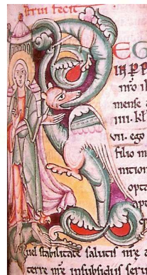
The First Code of English Law