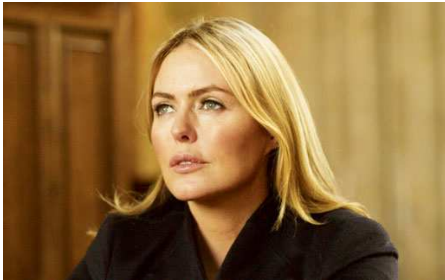
PATSY KENSIT - HOW WE DID IT