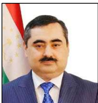
Huseynzoda Muzaffar Mahmurod , Deputy Minister of Foreign Affairs of the Republic of Tajikistan

In 2000 Rahmonzoda has been appointed as a member of the department of translation of the Presidential Administration. From 2005 to 2012 he was Minister of Education. From January 2012 to 2014 Rector of Pedagogical University. From 15 December up to now he is Assistant of the President of the Republic of Tajikistan on social affairs and communication with community.