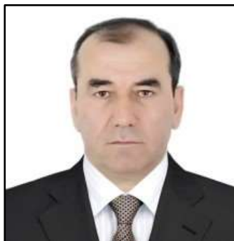
Usmonali Usmonzoda , Minister of Energy and Water Resources

In 1982 graduated the Energy Department of the Tajik Polytechnic Institute, after which worked as Engineer of the Department of Automation and Computer Engineering of the same institute till 1984. From 1985 Graduate student of the Moscow Energy Engineering Institute in Moscow where in 1988 is awarded degree of Candidate of Technical Sciences. 1989 -1991 Assistant, Senior Lecturer, Department of Electric Drives and Automated Control Systems, Tajik Polytechnic Institute. 1991 - 1996 Associate Professor and Deputy Dean of the Energy Department of the Tajik Polytechnic Institute. 1997 - 1999 Director of the State Energy Inspectorate (Tajikgosenergonadzor) for the Districts of Republican Subordination. 1999 - 2001 Deputy General Director of Tajikgosenergonadzor 2001 - 2003 Head of the Department for Energy Policy, Ministry of Energy of the Republic of Tajikistan 2003 - 2009 Deputy Director of the State Institution "Center for Project Management of the Electric Power Sector" of the Republic of Tajikistan 2009 - 2013 Director of the State Institution "Center for Project Management of the Electric Power Sector" of the Republic of Tajikistan. From 2013 to present Minister of Energy and Water Resources of the Republic of Tajikistan