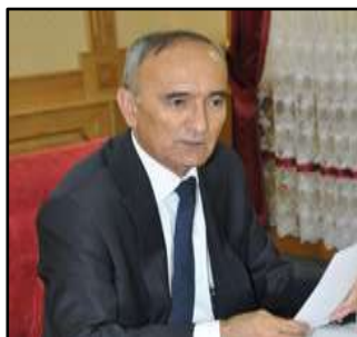
Akademician Imomzoda Muhammadyusuf Saidali , Rector of the Tajik National University, Republic of Tajikistan

In 2005-2006 he worked as Deputy Minister of Education. From December 2006 to 2013, he served as First Deputy Minister of Education. By decree of the President of the Republic of Tajikistan Emomali Rahmon, Farhod Rahimi dated December 6, 2013, was appointed president of the Academy of Sciences of the Republic of Tajikistan.