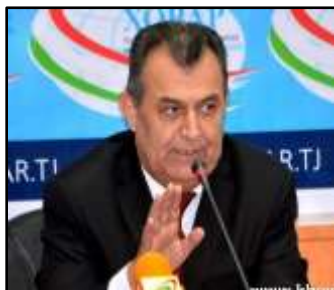
Nuriddin Said , Minister of Education and Science, Republic of Tajikistan