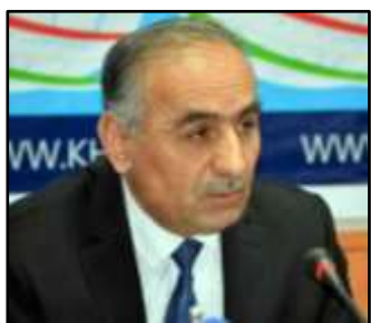
Shamsiddin Orumbekzoda , Minister of Culture of the Republic of Tajikistan

Graduated from Tajik National University in 1997 and Diplomatic Academy of the Ministry of Foreign Affairs of the Russian Federation in 1999. From 1999 to 2000 served as the Deputy Director on Agency for support and development of small business under the Government of the Republic of Tajikistan. From 2000 to 2002 served as the Third Secretary, the Second Secretary of Personnel Department of Ministry of Foreign Affairs, Republic of Tajikistan. From 2002 to 2005 served as the second secretary of Embassy of the Republic of Tajikistan in the Kingdom of Belgium. From 2005 to 2008 was the Head of Division of Regional organizations, International Organizations' Department, Ministry of Foreign Affairs, Republic of Tajikistan; and from 2008 to 2011 served as the Head of International Organizations' Department, Ministry of Foreign Affairs, Republic of Tajikistan. In 2011 was appointed as the Ambassador Extraordinary and Plenipotentiary of the Republic of Tajikistan to the Republic of Uzbekistan where he served till 2016. From 2014 to 2016 was also the Ambassador Extraordinary and Plenipotentiary of the Republic of Tajikistan to Malaysia with residence in Tashkent. Appointed Deputy Minister of Foreign Affairs of the Republic of Tajikistan since 29 March, 2016.