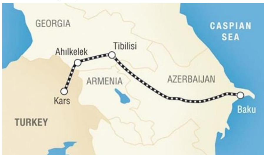
Figure 2: the Baku-Tbilisi-Kars (BTK)